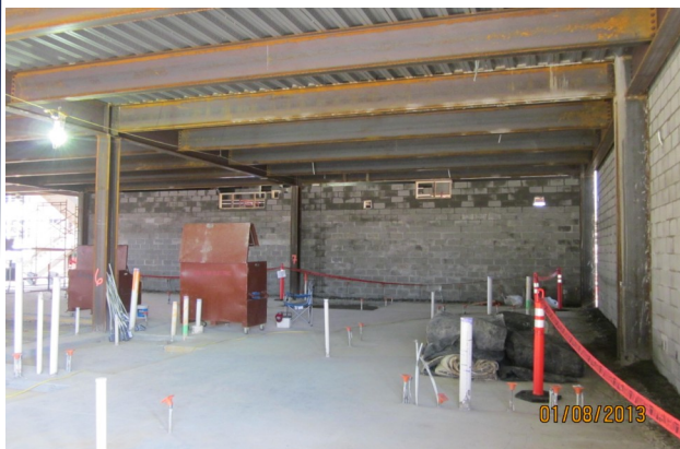
Above: The start of the CMU Block walls are in place on the first of Area D in the East corner. Also shown is the completed first floor concrete slab.