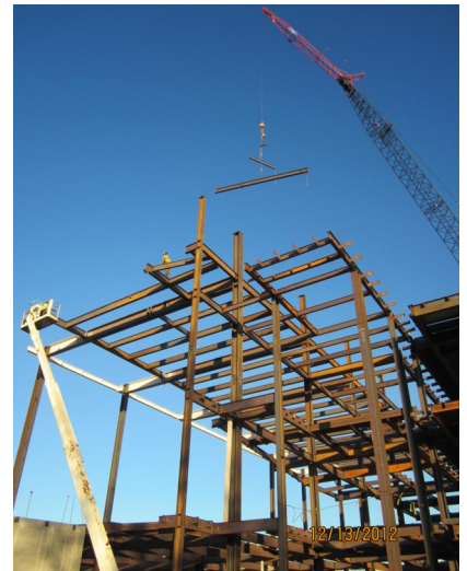
Above: Two Steel Connectors wait to receive two beams being swung in over head while erecting the top two floors of area B.