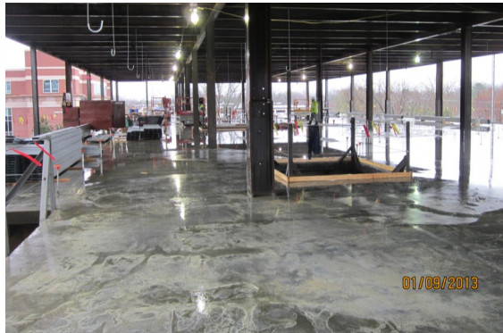
Above: Third floor Area D completed slab. Now Electrical workers start their rough-in for the floor.