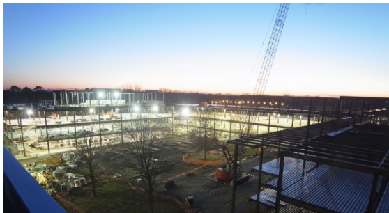
Above: A view at dusk from the library roof.