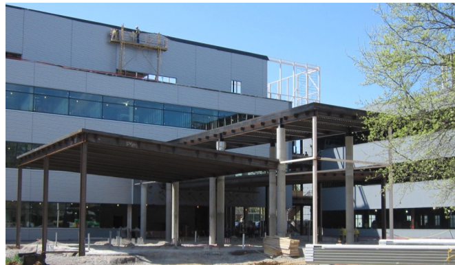
Above: Lecture halls on the North side of area D are progressing with structural steel, concrete encased columns, and in slab rough-ins all complete. In the background area D curtain wall is nearly complete and workers are installing metal panels in the penthouse on the top floor.