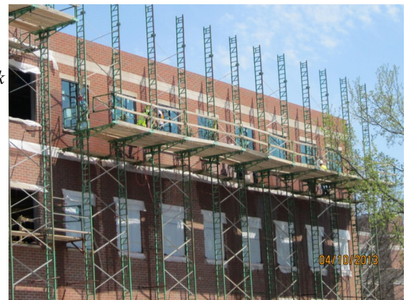
Right: Masonry wraps up in area D with workers cleaning the brick and removing plastic from the windows as they work their way back down the building.