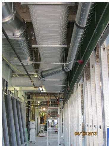
Left: Ductwork makes its way through the 3rd floor and interior metal framing is also progressing. This view is down one of the main corridors in area D where individual rooms are being divided up and taking shape.