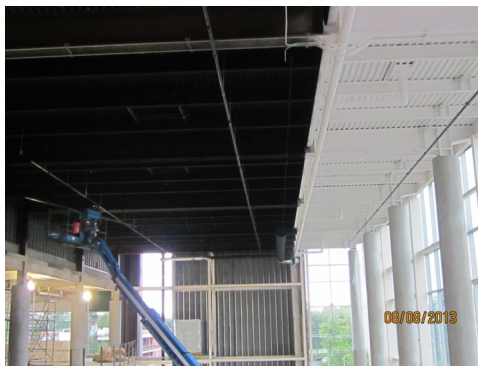
Above: The Atrium ceiling receiving sprinkler piping. This portion of the ceiling will not be visible after the wood panels are put in place.

“It’s easier to explain price once, than apologize for quality forever.”