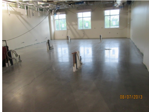
Above: An Area D Lab floor right after polishing and before being covered. The polishers complete on average 2 rooms a day.