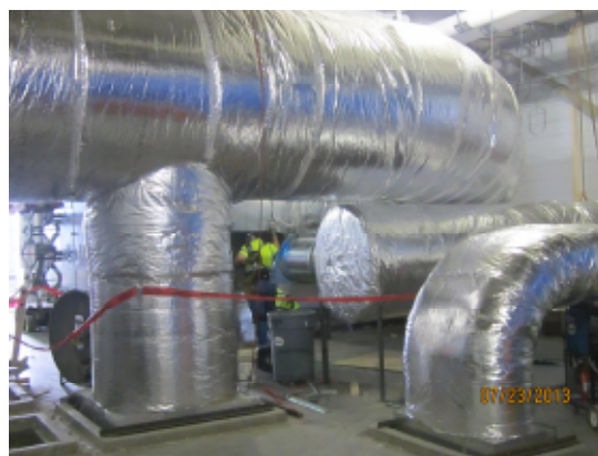
Above: Insulated duct connections to the Air-Handler in preparation of blowing air. Right: Overhead work in Area D—3rd Floor now including cable trays.

“The most prepared are the most dedicated.”