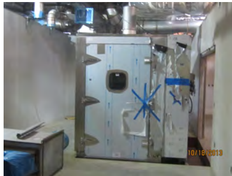
Above: The Cage Wash in the Vivarium has been assembled and set. Its purpose is to sterilize equipment used to house laboratory animals. Below: Lights are on in Area D Fume Hoods! Lights have also been turned on in the 2nd and 3rd Floor Labs in Area D.