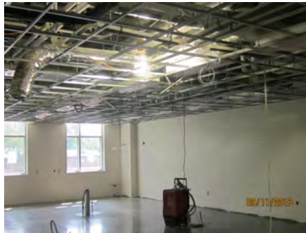
Above: Ceiling grid starting to be installed in the Area D 2nd Floor Labs.. Below: A Safety Station is set for installation. These will include emergency shut-offs, projector and shade, controls, among others.